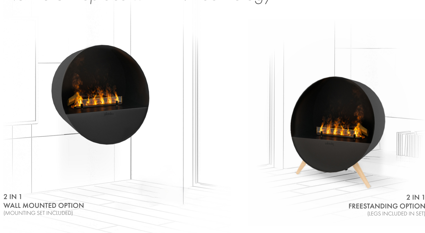
2 IN 1 WALL MOUNTED OPTION (MOUNTING SET INCLUDED)

Net Zero fireplace with BEV Technology ®